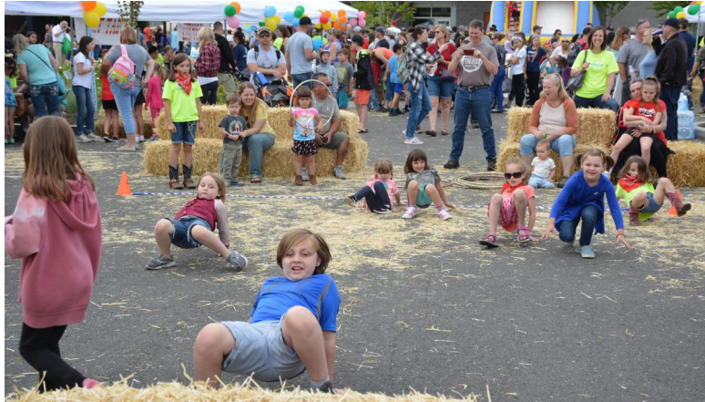
Kids at Yelm's Prairie Days enjoy a crab-walking race Saturday, June 29, at Yelm City Park.

Click on the picture for the entire article or visit www.yelmonline.com