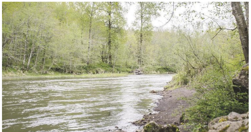
The Nisqually River flows on an early, spring morning near the 6th Avenue fishing and river access site.

Thurston and Pierce counties were among nearly a dozen other counties that will be the recipients of a total state investment of $45 million by the Washington State Salmon Recovery Funding Board to help salmon populations. Click on the picture for the entire article or visit www.yelmonline.com